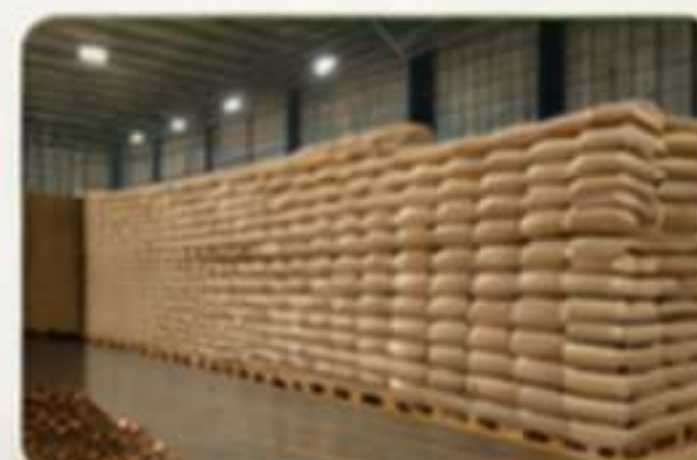
Hygienic Packing & Storage