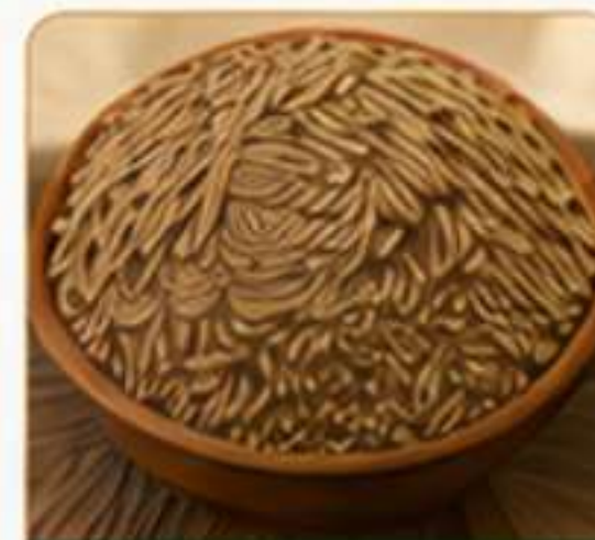
CUMIN SEEDS (JEERA)