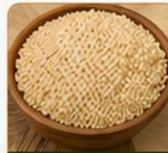
SESAME SEEDS (TIL)