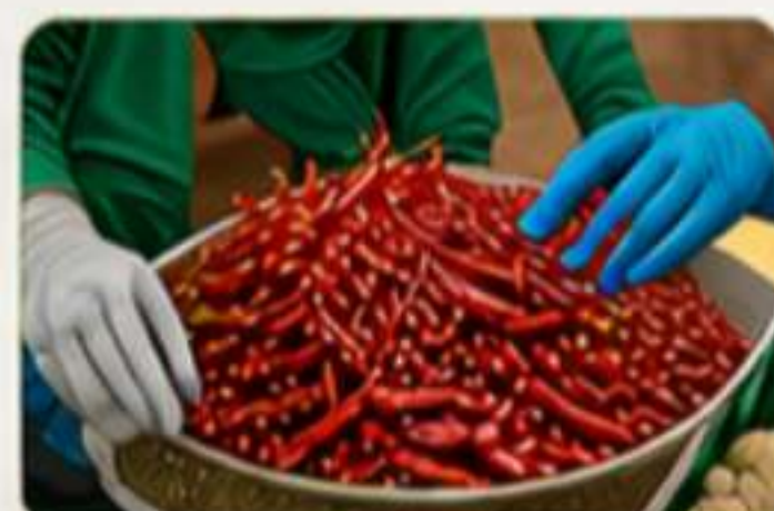
Quality Checked in Every Batch