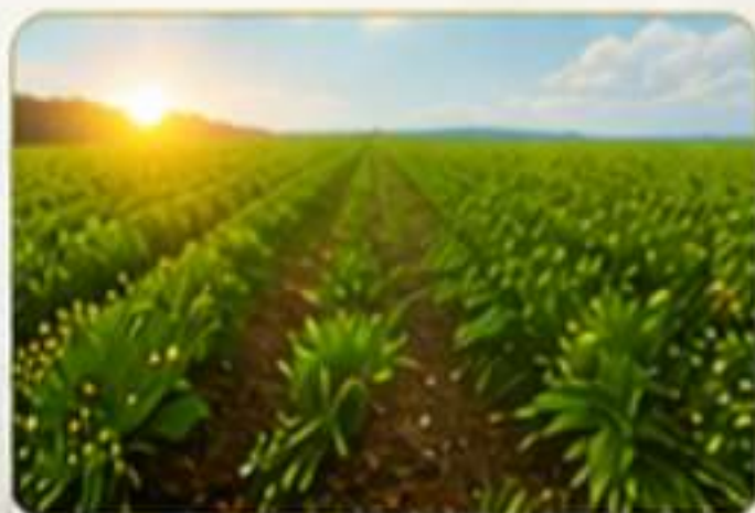
Carefully Sourced from Trusted Farms