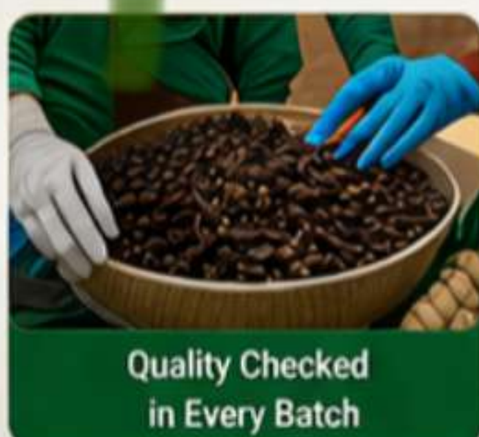
Quality Checked in Every Batch