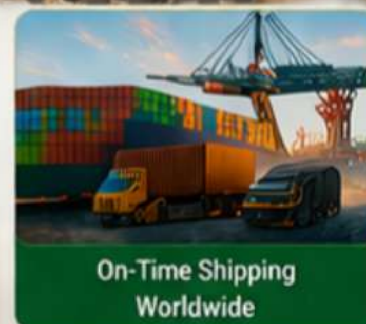
On-Time Shipping Worldwide

Head Office: Shaktinagar, Ratanpar, Surendranagar, Gujarat, India - 363020