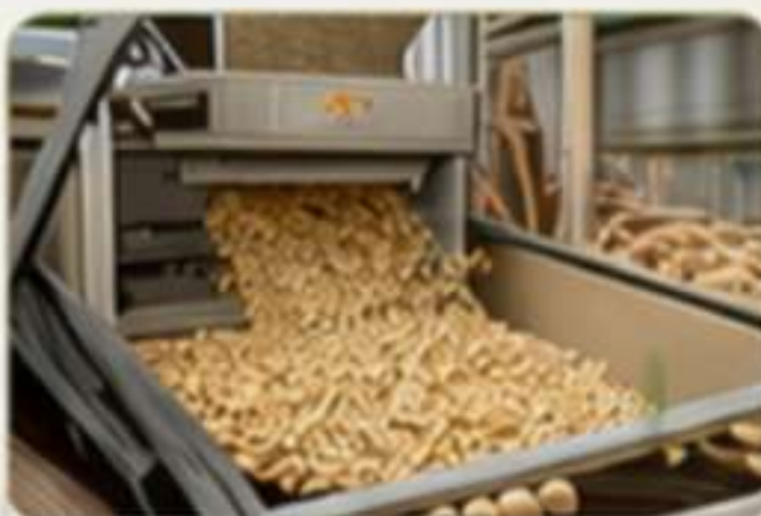
Advanced Cleaning & Sorting