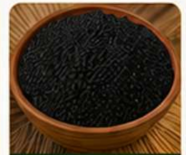
NIGELLA SEEDS (KALONJI)

We offer a wide range of spices in 25kg, 50kg & custom packaging as per buyer requirement.