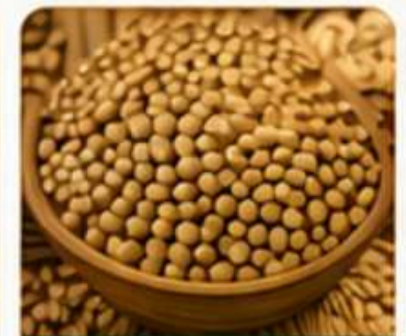
CORIANDER SEEDS (DHANIYA)