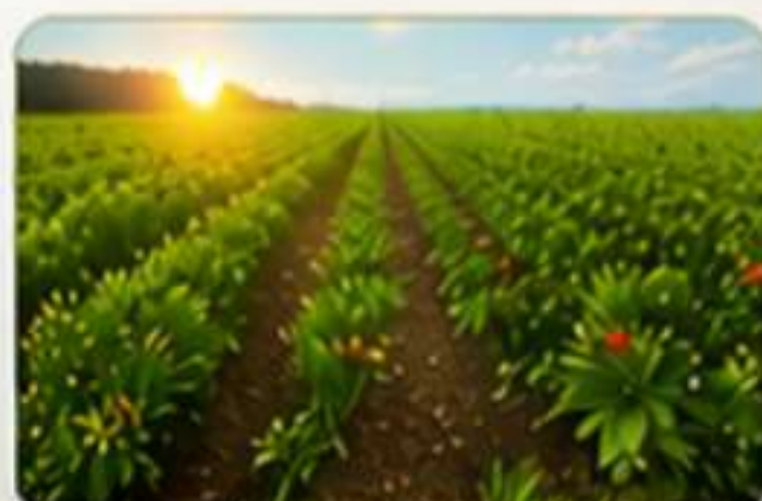
Carefully Sourced from Trusted Farms