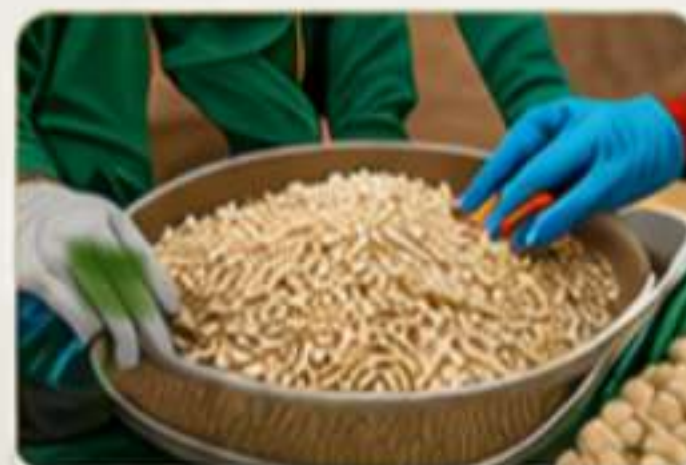
Quality Checked in Every Batch