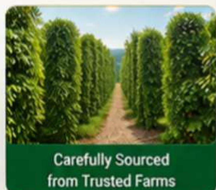
Carefully Sourced from Trusted Farms