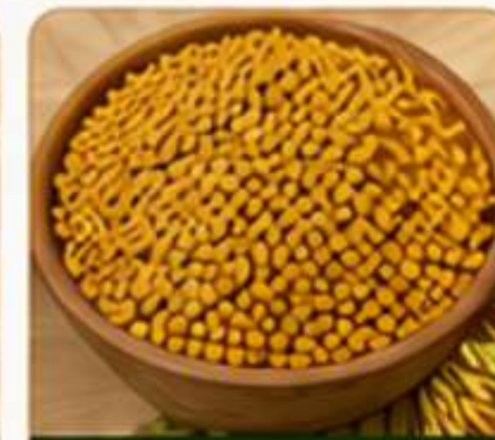
FENUGREEK SEEDS (METHI)