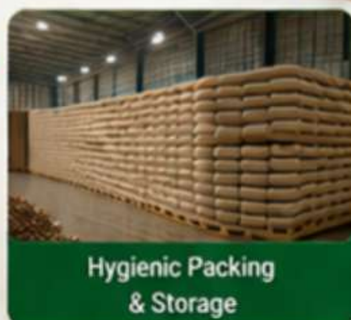
Hygienic Packing & Storage