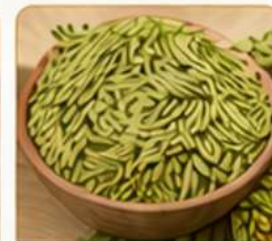
FENNEL SEEDS (SAUNF)