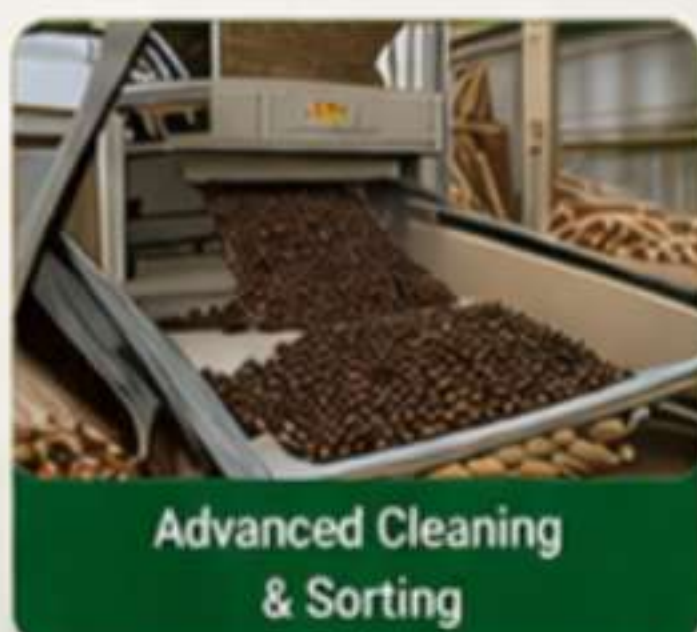
Advanced Cleaning & Sorting