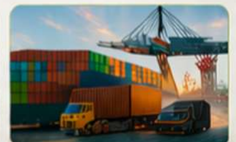
On-Time Shipping Worldwide

Head Office: Shaktinagar, Ratanpar, Surendranagar, Gujarat, India - 363020