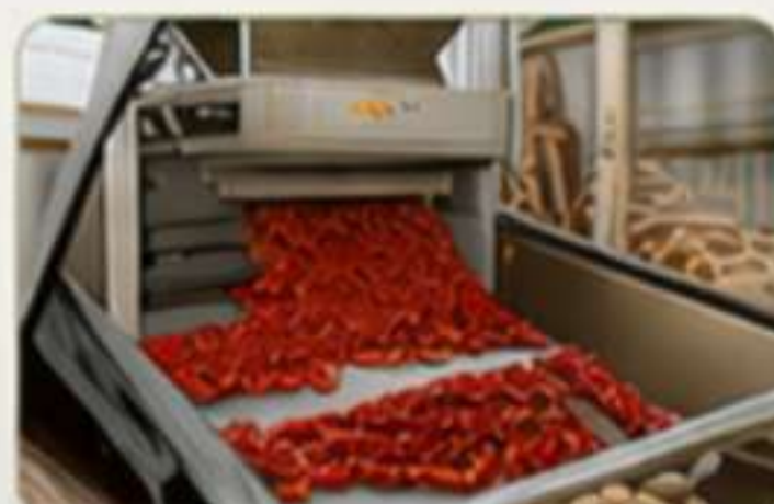
Advanced Cleaning & Sorting