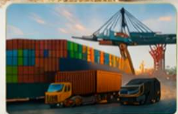
On-Time Shipping Worldwide