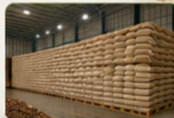
Hygienic Packing & Storage